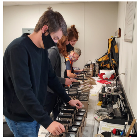
The FUSRAP radiological survey team checks their instruments' calibrations daily. This step is necessary for data accuracy.

Every morning, the field team meets to discuss safety, lessons learned, and plans for the day. They communicate with property owners and then look over the sampling site for potential hazards (poison ivy, fall and trip hazards, wild and domestic animals).