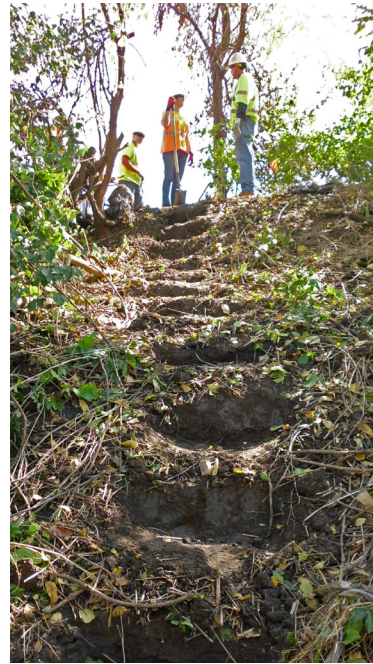
Project scope, scheduling, bad weather, or difficult access can lengthen the CWC sampling timeline. Additional actions may also be required. For example, a crew may need additional time to clear away heavy brush or cut steps into a steep embankment.

After contacting Missouri One Call to locate underground utilities, teams use Global Positioning System (GPS) to locate, flag, and collect photos of sampling locations indicated in the WP. They record the location coordinates and elevations before the sampling crews arrive.