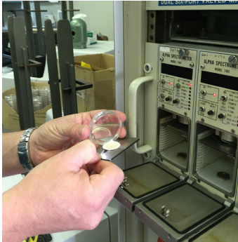
Alpha spectroscopy is used to analyze each sample’s individual radiological isotope.

USACE established the onsite laboratory to test samples for uranium, thorium, and radium from CWC monitoring, other SLAPS Vicinity Properties, and St. Louis Downtown Sites remediation efforts. The transfer of samples from sampling teams to the FUSRAP Laboratory is tracked by a Chain-of-Custody form that accompanies the samples while they await analysis and provides sample information to the lab staff. The Chain-of-Custody documentation is required to support sample validity. It verifies that the samples are not tampered with before being received by the lab. The “holding time” from sample collection until the start of sample preparation is regulated to ensure sample stability.