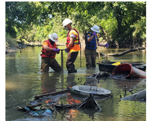
Debris and site conditions make sample collection challenging.

Seven FUSRAP team members support and perform radiological scans of consolidated materials and surface soil using portable radiological instruments. They move radiation detectors at a constant distance from the surface being investigated. For surface soil, gamma walkover radiological scan surveys can be particularly difficult because of brush, steep banks, and rough terrain, again increasing the time required. Daily surveys are processed and reviewed by FUSRAP's geographic information system (GIS) team and by a health physicist to determine if additional investigation is needed.