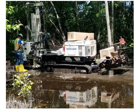
Drill rigs drill for soil samples quickly but getting them in place is not always easy because dense brush and woods and other obstructions limit access to many sampling locations.

Sediment and soil sample teams place samples in cans, label them, and seal them before transfer to the FUSRAP laboratory at SLAPS. In log books and drilling logs, the team geologist documents such information as soil type, color, sample depth, moisture, and radiological readings. Decontamination crews clean, decontaminate, and again survey sampling equipment before its next use.